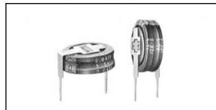
Marking color : White print on an indigo sleeve